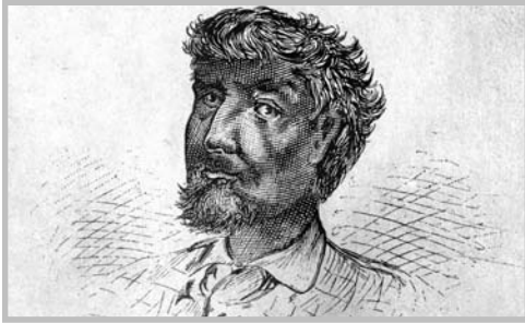
Portrait of Jean Baptiste Point DuSable

1780s: Jean Baptiste Point DuSable arrives in Chicago. Considered the area's first permanent settler, DuSable is a merchant, trader, farmer, and a Catholic.