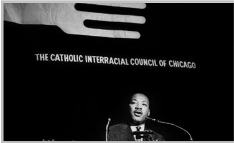
Dr. Martin Luther King Jr. accepts an award from the Catholic Interracial Council, 1964

1946: Chicago Youth Symphony Orchestra is established. The Catholic Interracial Council is formed in Chicago.