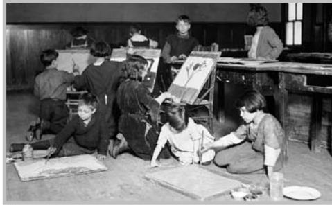
Children painting in a Hull-House art class, 1924

1889: Jane Addams opens Hull-House on the Near West Side. Mother Frances Cabrini arrives from Italy to serve Chicago's immigrants.