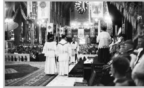
Mass at Holy Name Cathedral, Eucharistic Congress, 1926

1926: The 'L' experiences the single busiest day in its history during the Eucharistic Congress. Held in Chicago, the international event attracts more than one million Catholics.