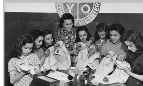
Embroidery class at a CYO community center, c. 1950

1930: The Catholic Youth Organization (CYO) is founded in Chicago. CYO sponsors after-school activities and sports for middle and high school students.