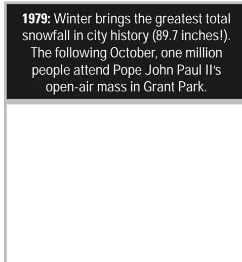
Poster celebrating the Pope's visit to Chicago, 1979